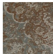
Nostalgic 85665 LRV 14.7