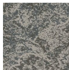
Heritage 85530 LRV 15.4